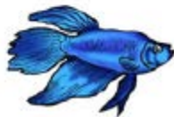
Figure 1: Caption for figure (sentence caps, left-aligned at bottom of figure)