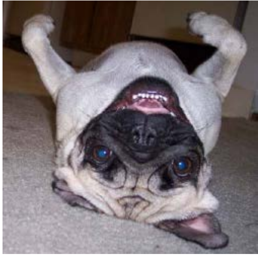
Figure 1: Playful, pooped Pug pup